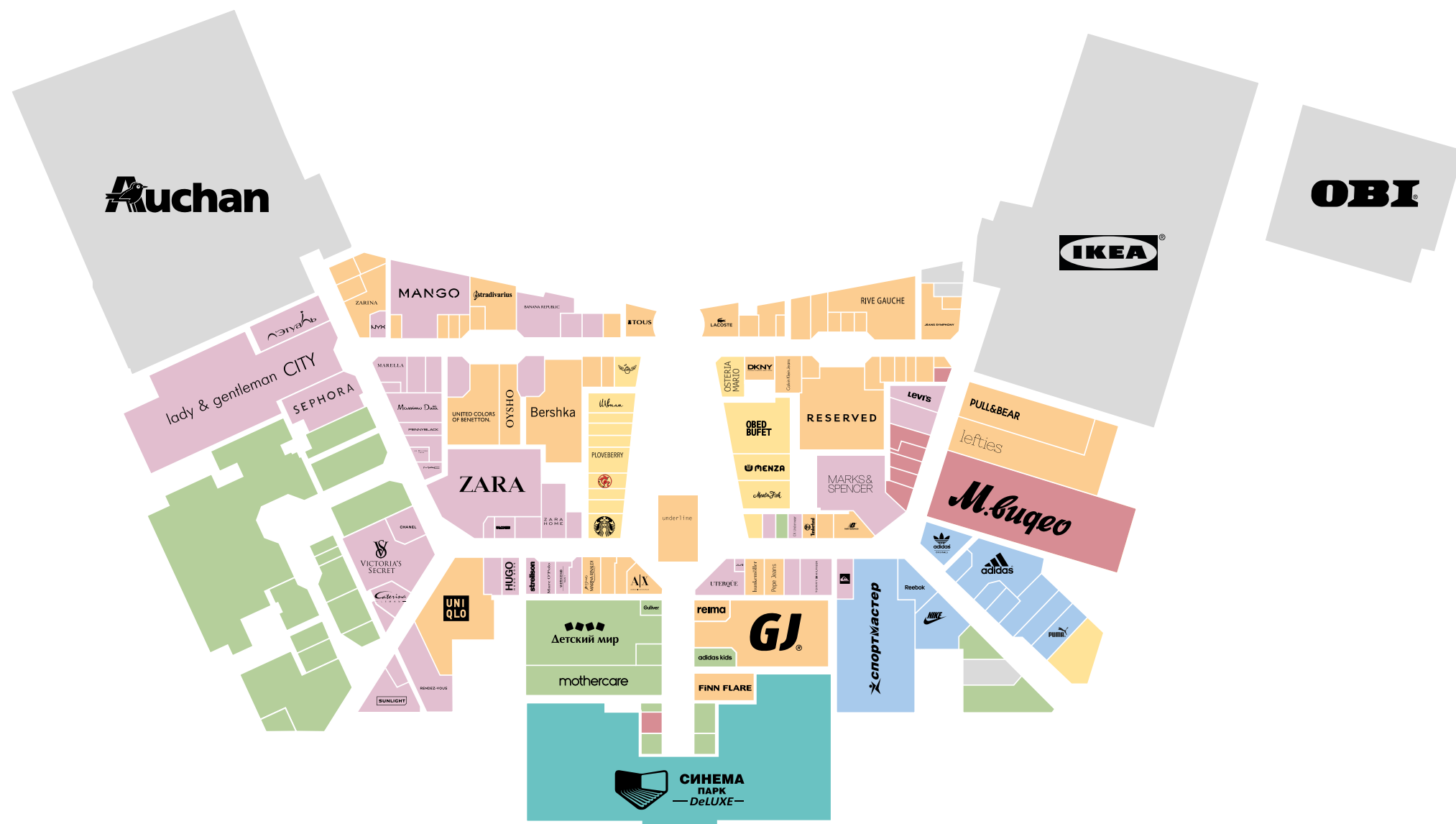
1 MEGA Teply Stan Level 1